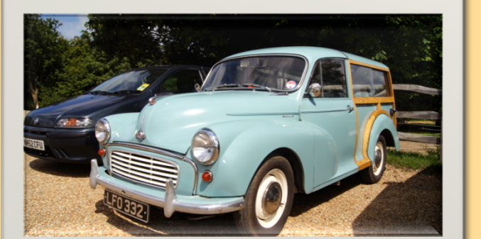
1960 Morris Minor1000 Woody wagon