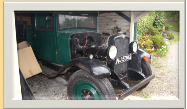
1932-33 Bedford 2-1/2 ton Truck